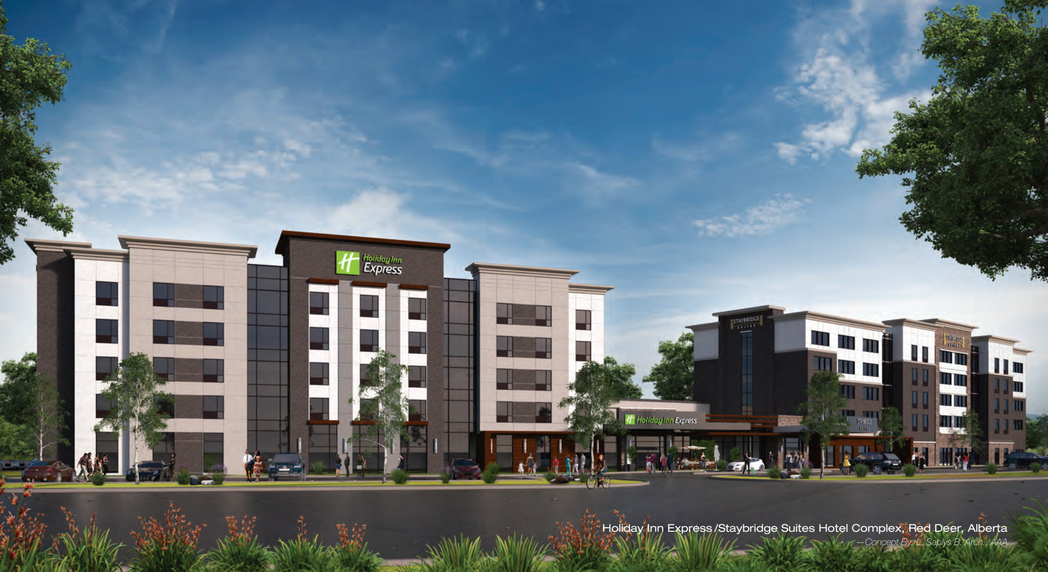
Holiday Inn Express / Staybridge Suites Hotel Complex, Red Deer, Alberta