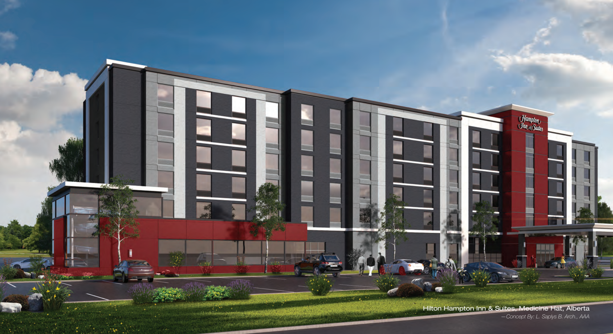
Hilton Hampton Inn & Suites, Medicine Hat, Alberta