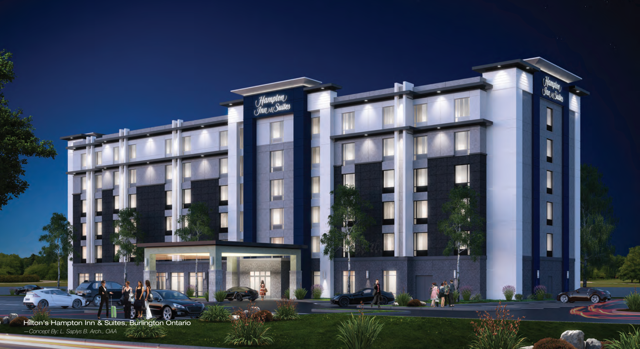
Hilton's Hampton Inn & Suites, Burlington Ontario