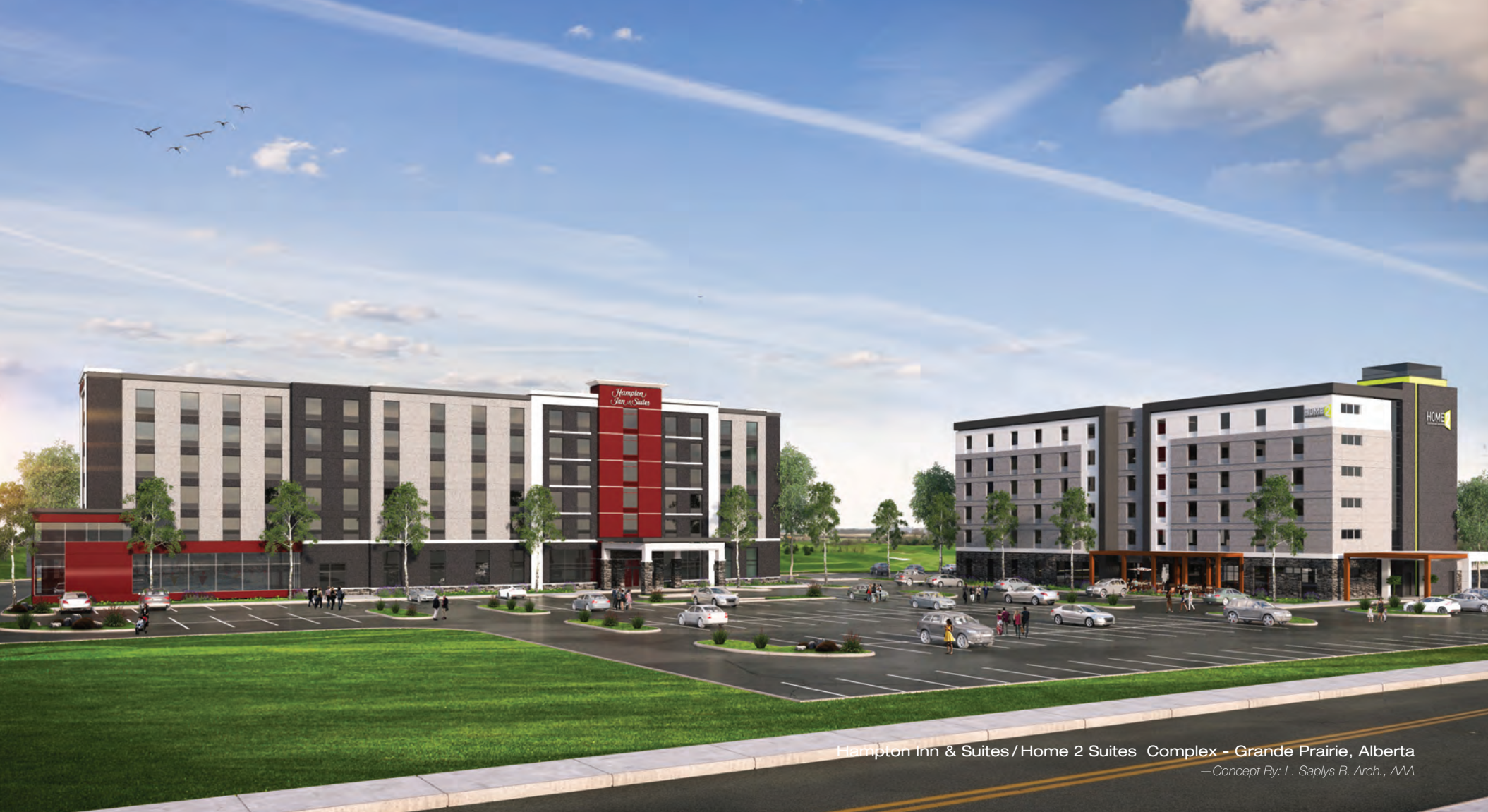
Hampton Inn & Suites / Home 2 Suites Complex - Grande Prairie, Alberta