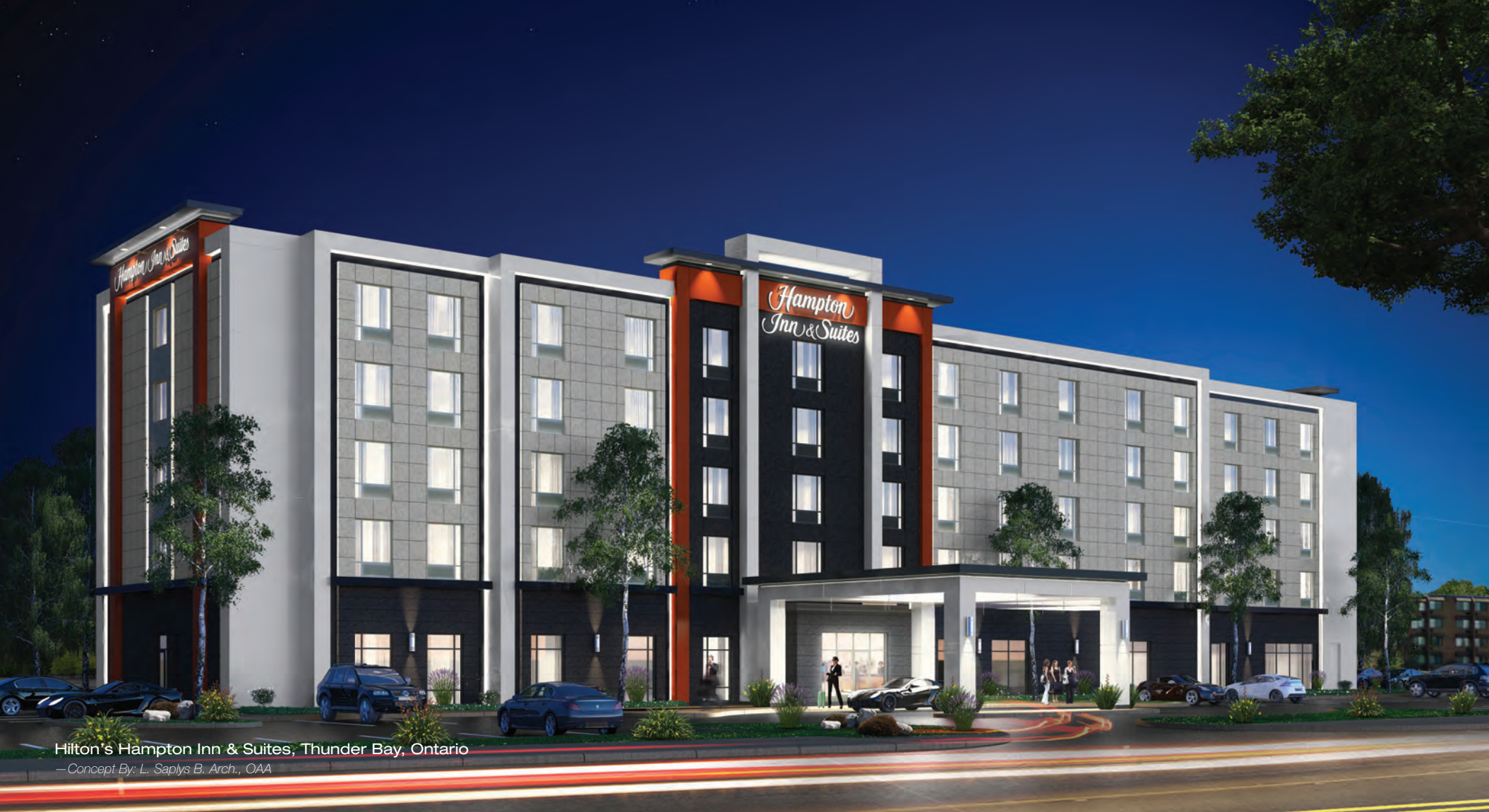
Hilton's Hampton Inn & Suites, Thunder Bay, Ontario