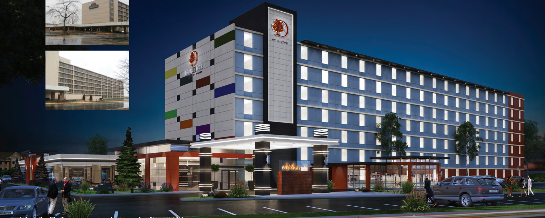
Hilton Double Tree conversion, Indianapolis (Airport) USA