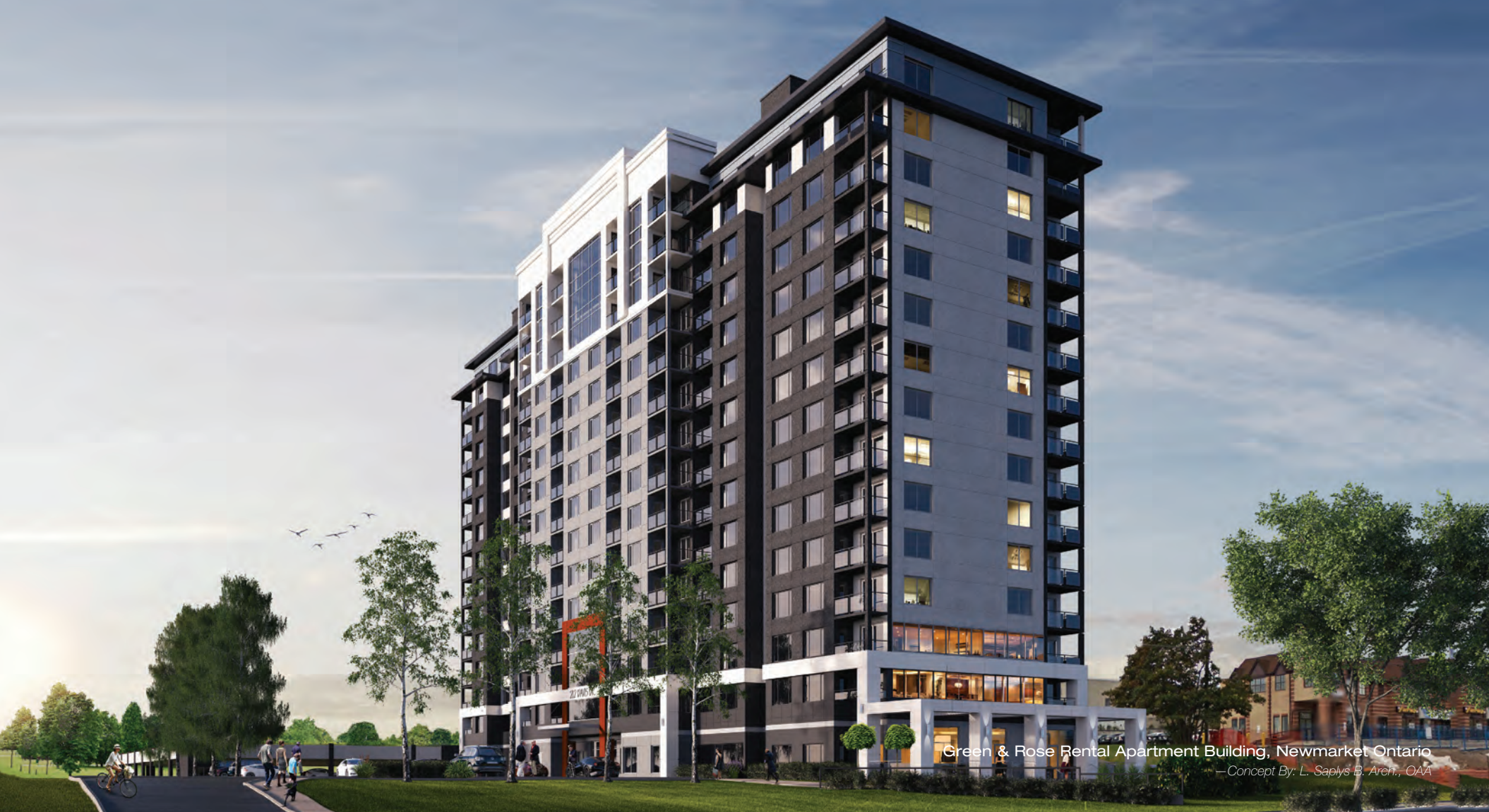
Green & Rose Rental Apartment Building, Newmarket Ontario