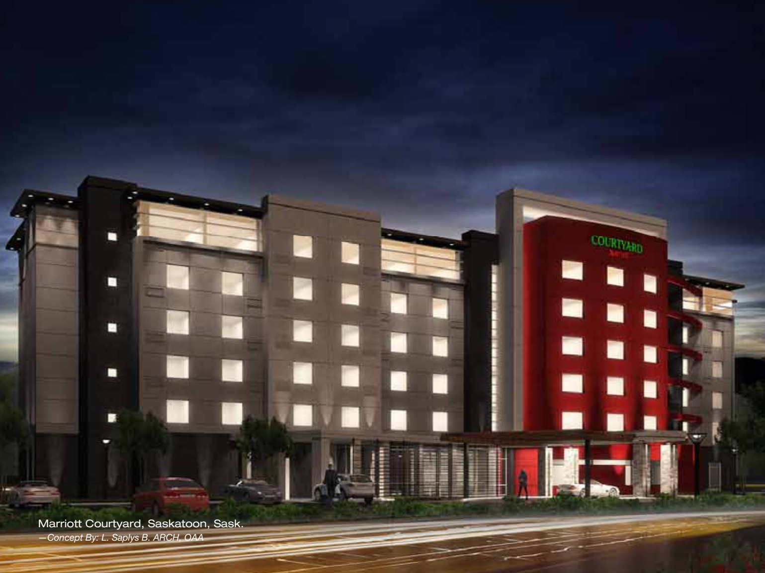
Marriott Courtyard, Saskatoon, Sask.