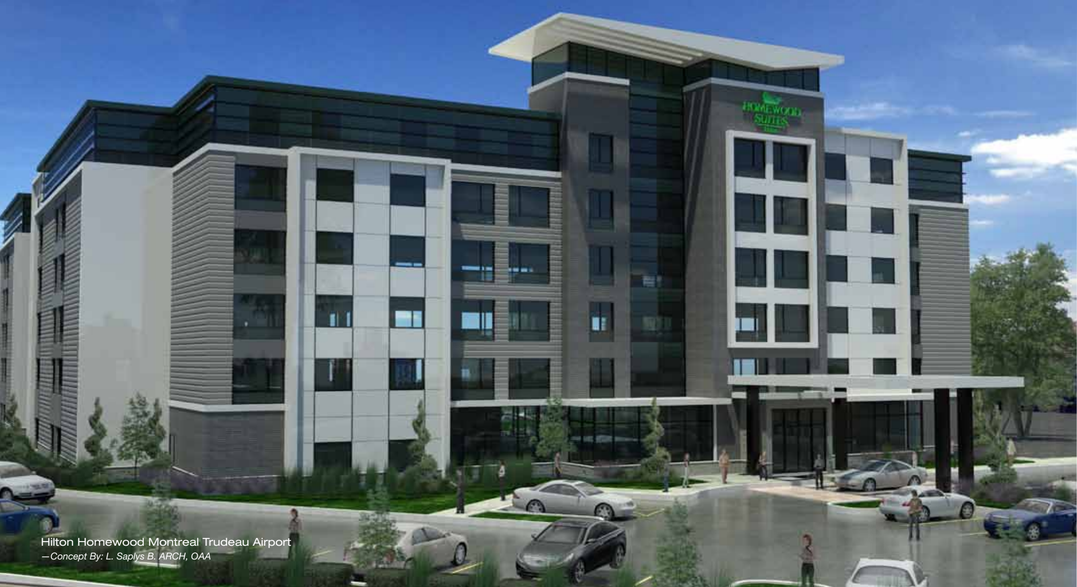
Hilton Homewood Montreal Trudeau Airport