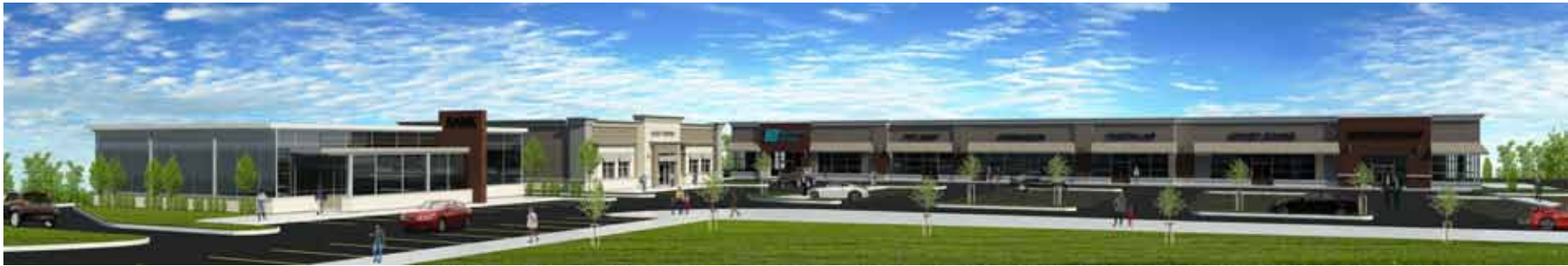
Brockville Gateway Retail/Commercial