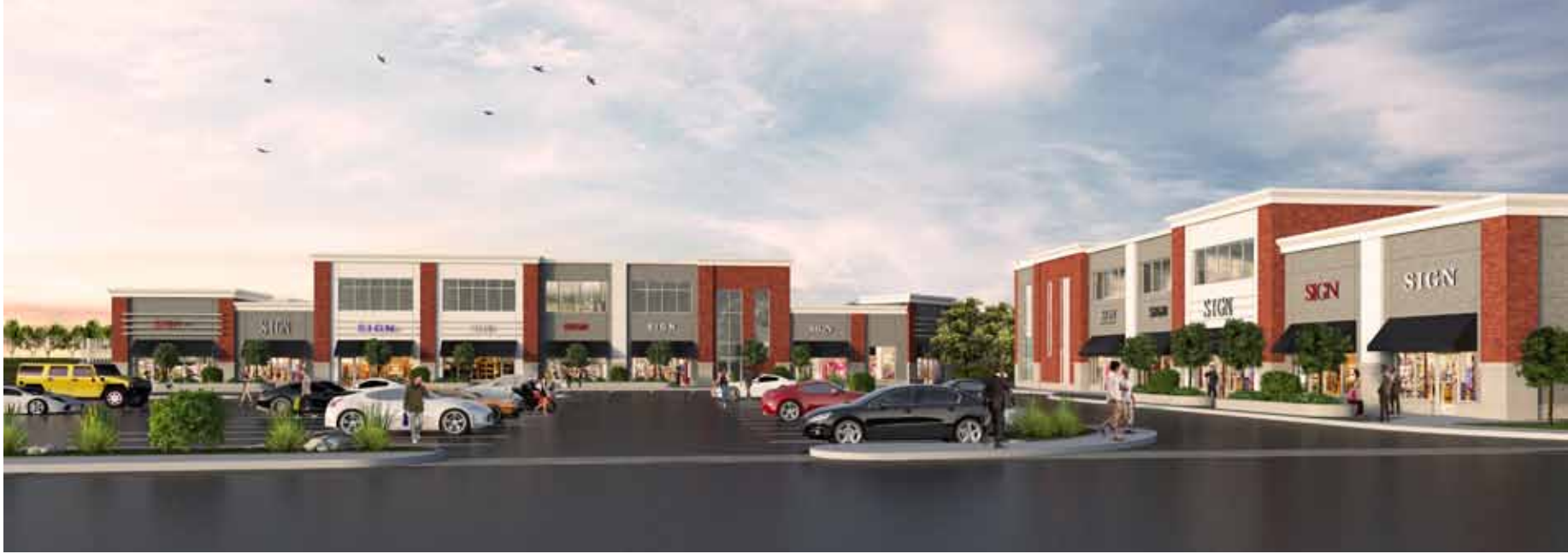
Brampton Gateway Retail/Commercial